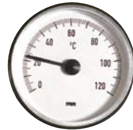
All units are fitted with a temperature indicator