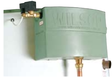
Wilson's Solenoid Valve with Cold Feed Tank

Wilson Rapid Flow dairy water heaters are fitted with sacrificial anodes as standard, to assist in combating the effects of aggressive water supplies.